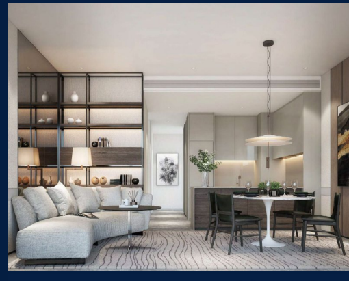
2 - Bedroom + Study