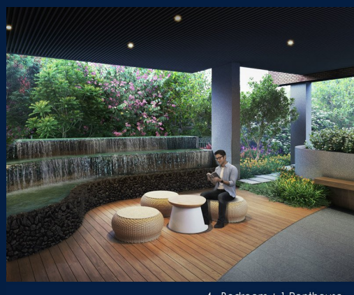
4 - Bedroom + 1 Penthouse