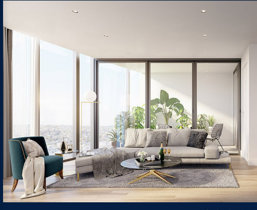
2 - Bedroom