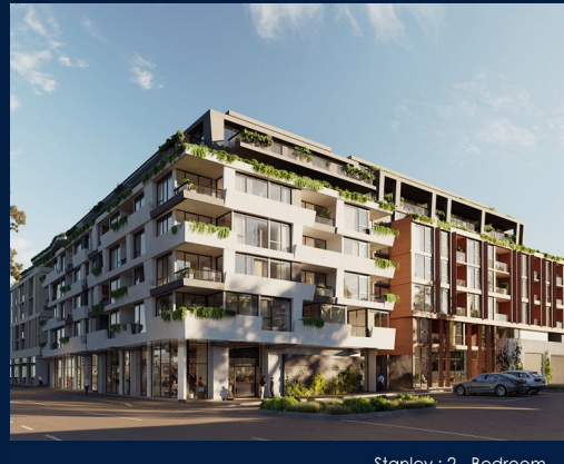
Stanley: 2 - Bedroom